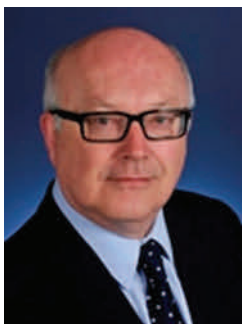
Senator, The Honourable George Brandis QC