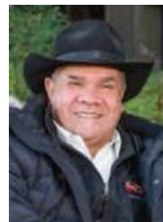
Prof Mick Dodson AM