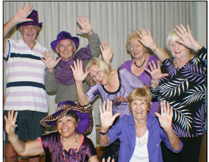
Bracken Ridge IRT Retirement Village residents preparing for WEAAD 2013.

The Ipswich Little Theatre Company has produced a play called Don't Just Sign on the Dotted Line , and will be performing this play free at the North Ipswich RSL on June 14 - phone 07 3810 6655 for more information. It will be funny and educational.